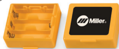
Battery Box 249297 Replacement quick-change battery box for easy, no-tool battery change. (Order from Miller Service Parts.)